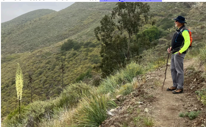
Something in Common

Our last hike for June on the 19th, will be, like the one to Serenity Swing, something we have never done before because the trail did not exist. The first 2.5 miles are now complete. It starts behind San Luis High School and heads up the mountain toward the old fire lookout overlooking the airport. Bik, Parkinson and Sisler scouted the trail on Friday, May 22nd. Total round trip distance is 5 miles with a 842 feet elevation change. Medium Hardness. Picture below of Bill Sisler communing with a bright yellow Yucca Plant. For more info on our hikes, visit our webpage at ramhikes.org or contact Russ Bik at rbik@me.com .